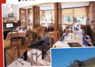
Restaurant with view to the Moselle