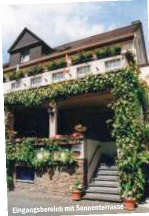
Eingangsbereich mit Sonnenterrasse

Hotel ★★★ Gasthaus & Restaurant zur post