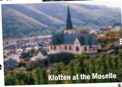
Klotten at the Moselle