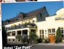
Hotel "Zur Post"

You can make your trip to the Nürburgring in the Eifel through the Hunsrück to Trier, Luxemburg, to the Rhine Valley or comfortably along the Mosel.