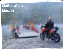
Klotten at the Moselle